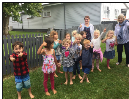
Life Education Truck learning this week