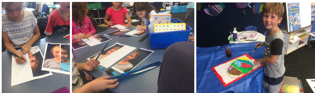
Self portraits & art in Kahawai